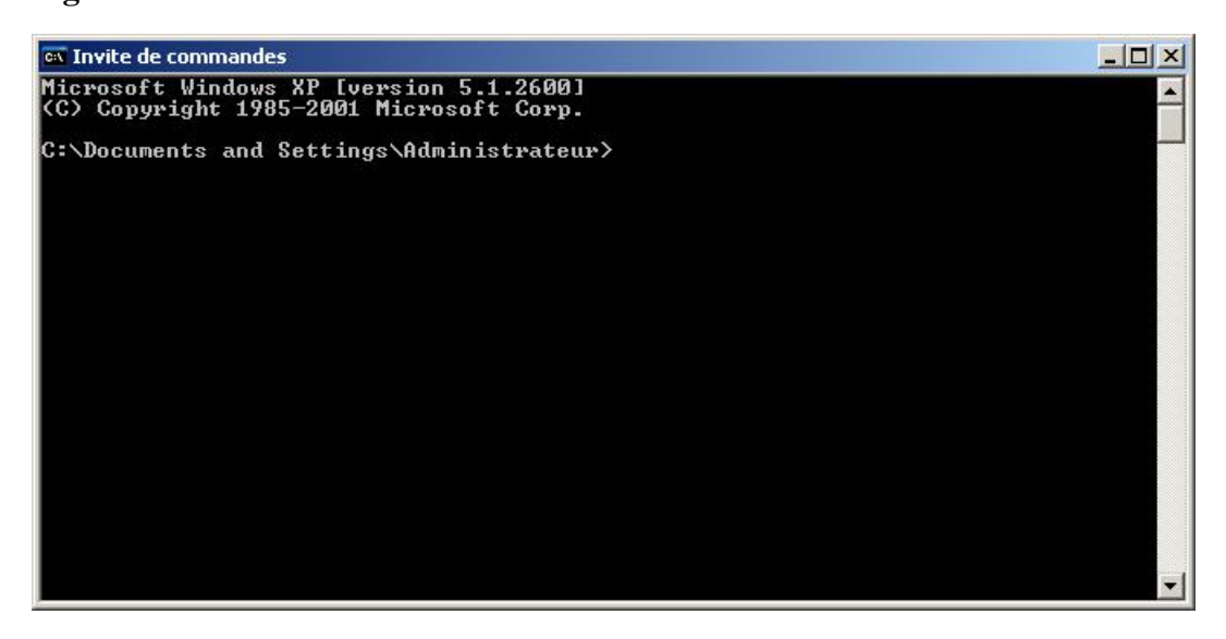
Figure 1.2. Windows terminal