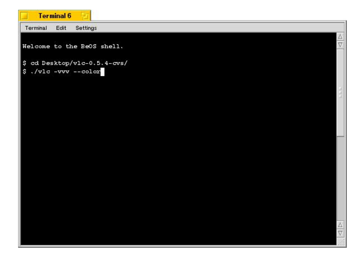
Figure 1.5. BeOS terminal

In the deskbar, go to Application and then Terminal: