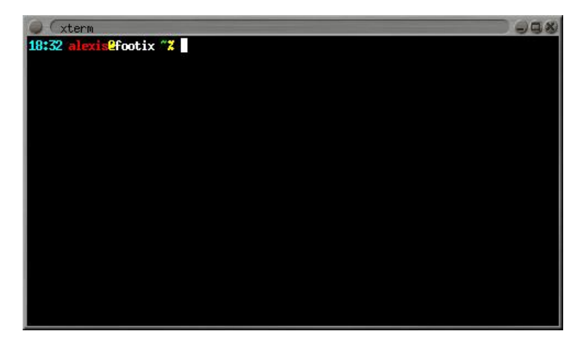
Figure 1.3. Linux X terminal

In the documentation, we adopt the following conventions for the Unix commands: